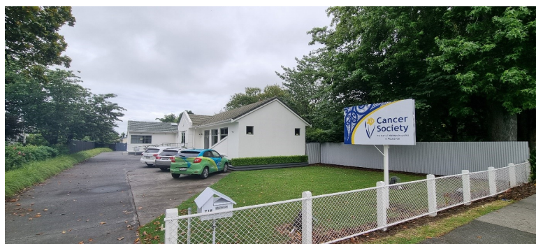
Our new Centre at 718 Gladstone Road, Te Hapara, Gisborne